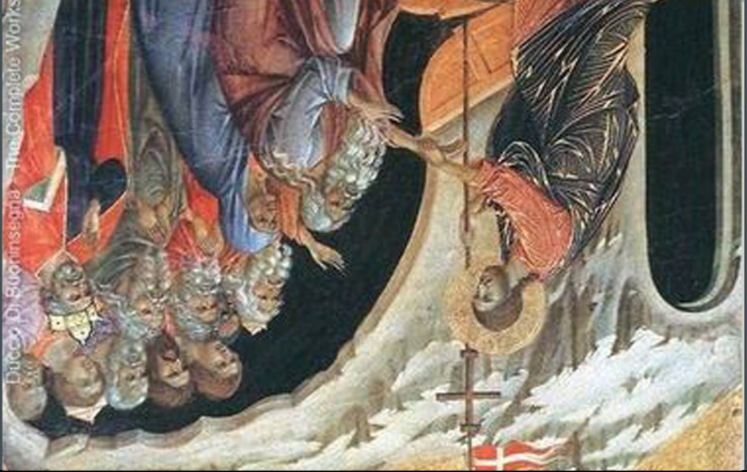
Duccio di Buoninsegna - The Complete Works