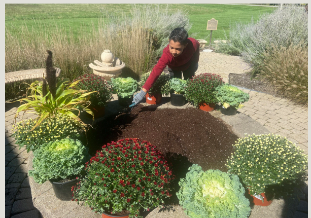
Jr Goya worked together after church on Sunday, October 15th planting the front garden with fall color.